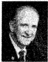
Congressman Sam Johnson Chairman of the Board

Congressman Sam Johnson is one of America's finest modern-day heroes. While a pilot in the U.S. Air Force during the Vietnam War, his airplane was shot down, and he spent nearly seven years as a prisoner of war. After his release in 1973, he remained in the Air Force until his retirement as a Colonel in 1979.